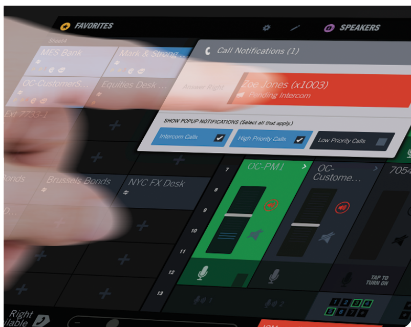
Tap or swipe to answer call on right or left handset

Go ahead – touch, tap, swipe, drag and drop – you're ready to do exactly what you want.